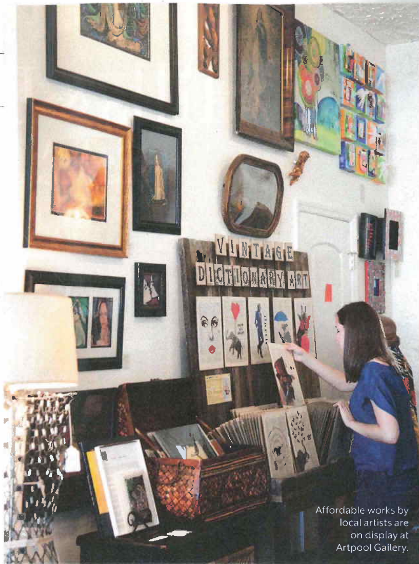
Affordable works by local artists are on display at Artpool Gallery.

hemmed in by Tampa Bay to the east, the city's revitalization can only head west. This shines the spotlight on the Grand Central District—a pedestrian-friendly area that is also a designated Main Street by the National Trust for Historic Preservation. The district's main thoroughfare, Central Avenue, features both double-wide sidewalks and street parking. Here are some of our favorite spots.