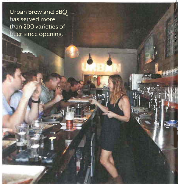
Urban Brew and BBQ has served more than 200 varieties of beer since opening.

This new, casual joint celebrates the art of 'cue with items like smoked pulled pork ($10) and skillet mac-and-cheese ($5). On tap, choose from 18 craft brews, including ones from local Rapp Brewing Company. urbanbrewandbbq.com