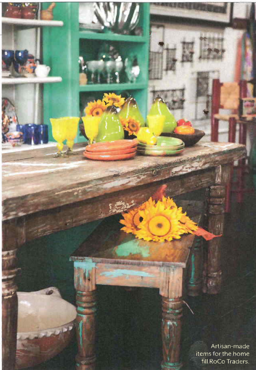
Artisan-made items for the home fill RoCo Traders.

The colorful shop houses unique finds from designers south of the border. Look for the one-of-a-kind jewelry brought back from annual buying trips to the sterling silver capital of the world—Taxco, Mexico. More of an indoor type? Don't miss RoCo's good selection of artisan-made home decor, including a variety of dishware, some reclaimed-wood furniture, and chimineas. 727/895-8922